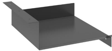
Metal shelf (right)