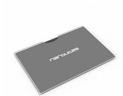
Plexiglas name card holder