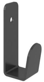
Metal hook for clothes