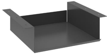
Metal shelf (central) for doors with mail slot

Customize your locker by using additional items.